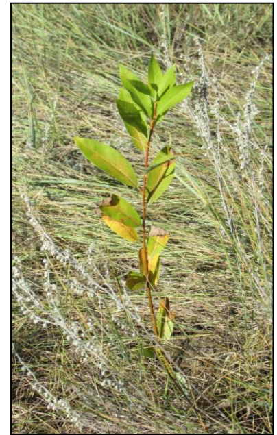
A willow planted on one of EALT's conservation lands

The Edmonton and Area Land Trust plays an important role in providing health, educational, economic and social benefits for the entire capital region, both urban and suburban. Contact us for more information about research sources.