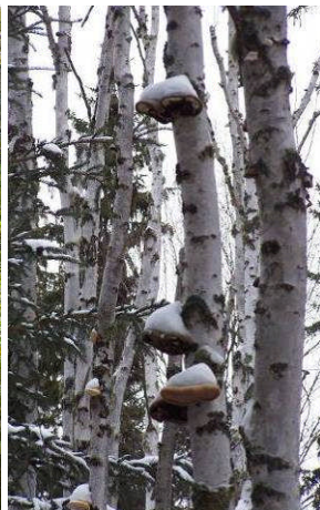
Fall colours on potential Parkland property, and conks on aspen