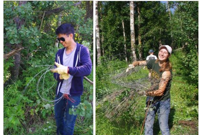
Hauling out barbed wire from the forest at the Hicks property.

presenting a barrier to wildlife. Twelve volunteers came out along with EALT and NCC staff. In the afternoon an interpretive walk was led by EALT Project Coordinator, Morgan Traverse where volunteers were able to pick berries and learn about some of the plants and animals that can be found on the property.