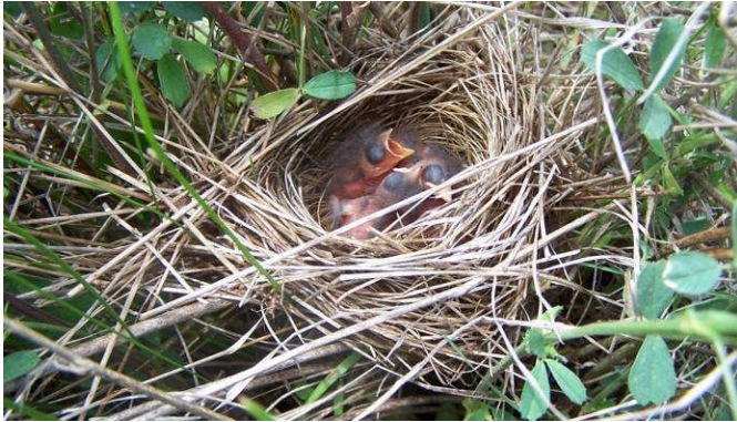
New born sparrows in nest found in the grasslands

2011 was a successful year for EALT, as we were able to acquire ecologically valuable land around the Capital Region. 2012 may show similar successes thanks to generous donors, and the Ecological Gift Program of Canada. This fall EALT has visited several potential properties that could add to our inventory of permanently protected natural areas. Like our currently held properties, these areas provide invaluable habitat for the native plants and animals that represent our beautiful country and provide an opportunity for these species to prosper for the benefit of future generations.