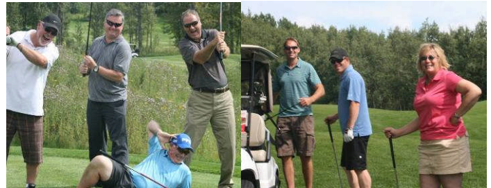
CLRA members having fun at their summer golf tournament

The CLRA wanted to see the funds go to a project related to reclamation, and felt fencing-related costs were appropriate. EALT certainly has a need to work on fencing, due to issues of neighbours' cattle breaking through their fences, and we hope to produce educational materials related to this topic, too. Many thanks to all!