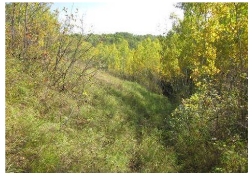
Potential property in Leduc County

EALT has increasingly been asked to consider accepting donations of properties or Conservation Easements, by interested landowners. This requires office research at first, but then site visits. We find ourselves increasingly busy in evaluating properties, and welcome those with field expertise contacting us to volunteer for such activities.